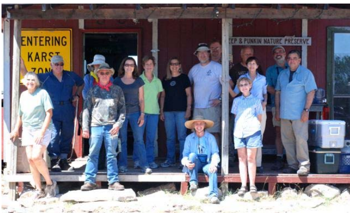
A great time was had by all on the Bexar Audubon trip to Deep & Punkin' Preserve on June 4-5. More photos: www.bexaraudubon.org .